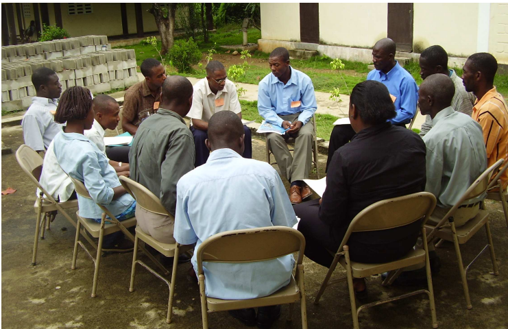
Small group discussions.