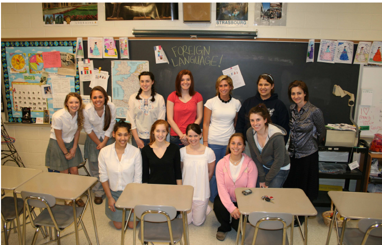
St. Gertrude High School (Richmond) Foreign Language Club